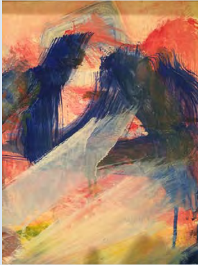
Woman II, 1961 Willem deKooning